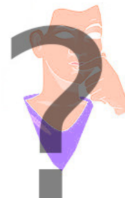
Fig. 3: Wanted: Human Researcher

You will work in an interdisciplinary environment between research on deductive AI (SAT Algorithms) and inductive AI (Big Data Analysis). You get the chance to use state-of-the-art prediction models, clustering techniques and feature selection methods. Help us to build a cost-efficient research robot and save the monkeys!