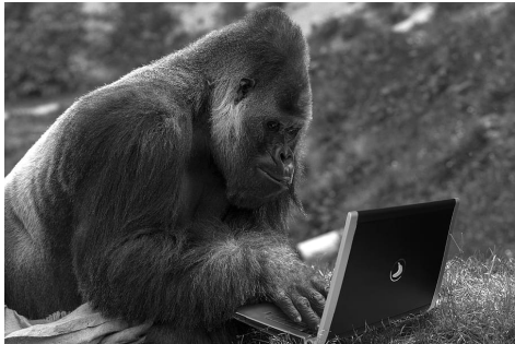
Fig. 1: Solbert the Monkey

An infinite amount of monkeys produces infinite amounts of code. Eventually, some of this code compiles into programs, and some of these programs are SAT solvers, which means that they correctly solve the NP-complete SAT problem.